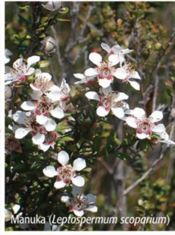
Manuka ( Leptospermum scoparium )

Disclaimer: Please note that track conditions may change. When walking in the natural environment you may encounter natural hazards. Land management agencies will not accept liability for any injury or damage resulting from such hazards. No guarantee is given that this publication is free from error.