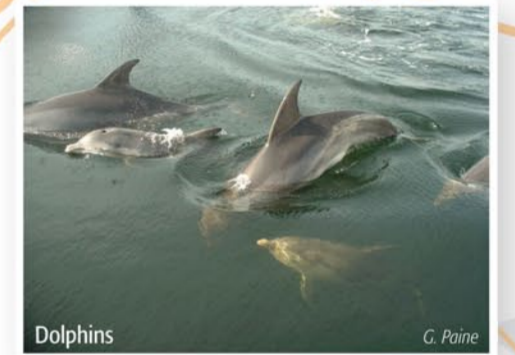
Dolphins C. Paine